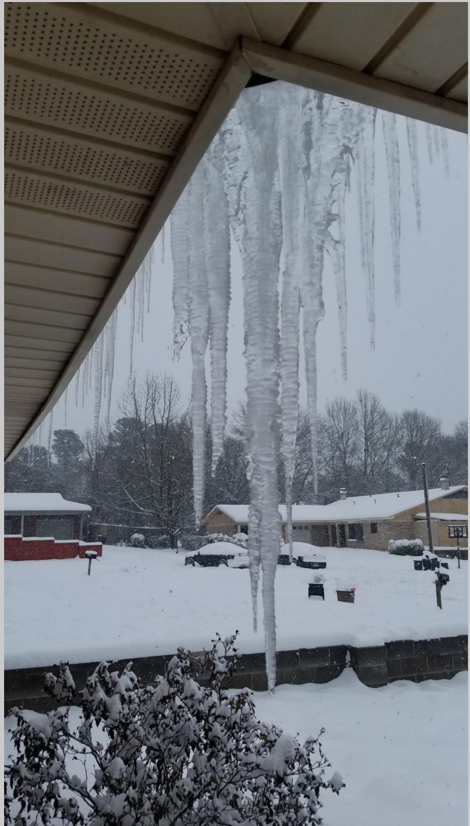
This icicle grew to 59" before starting to melt.